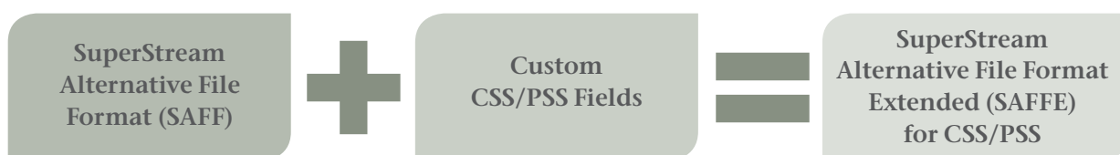
Figure 1 Conceptual representation of the SuperStream Alternative File Format Extended (SAFFE) for CSS/PSS schemes

Figure 2 shows a summary of the fields that make up the SAFFE for CSS/PSS. The fields italicised and in grey are not used by CSS and PSS and the fields shown in the dotted section are the custom requirements unique to CSS and PSS.